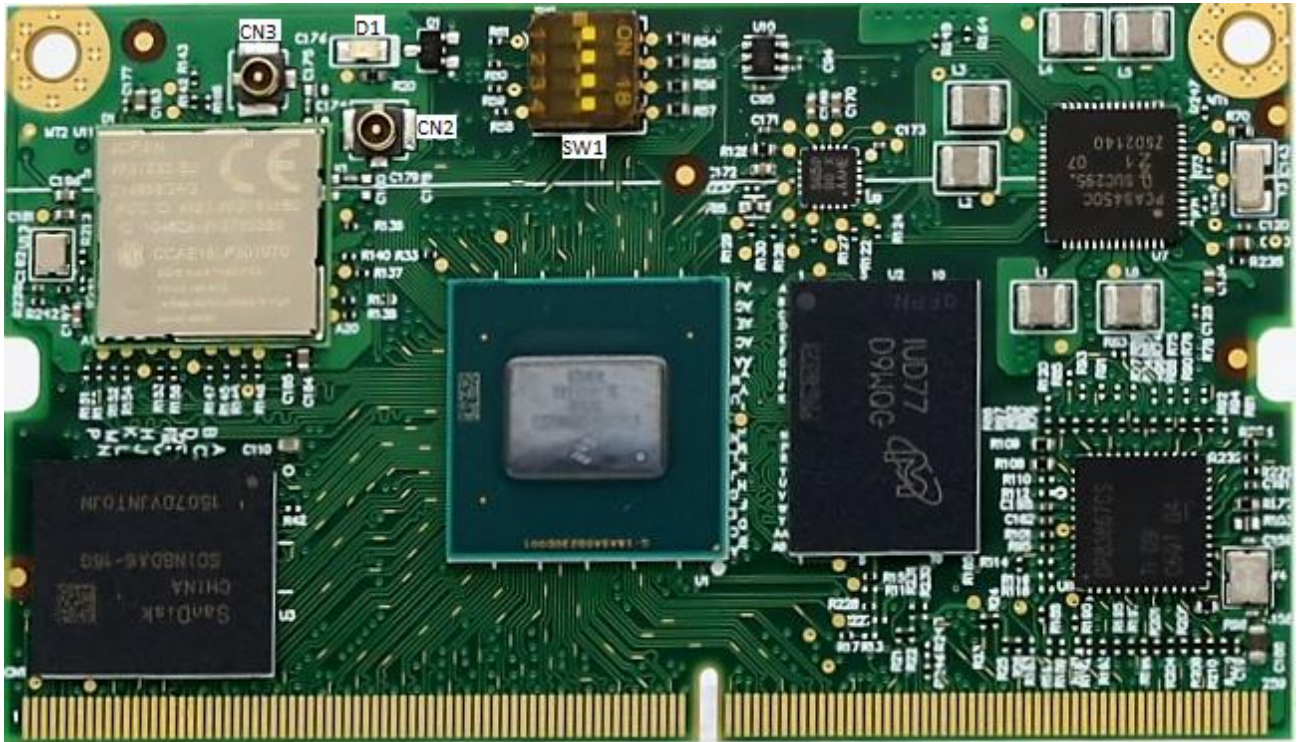
Figure 1-2: VEST i.MX8M Plus SOM Board User Accessible Connector and Dip Switch List

The table below lists the user accessible connectors and dip switch on the VEST i.MX8M Plus SOM Board.